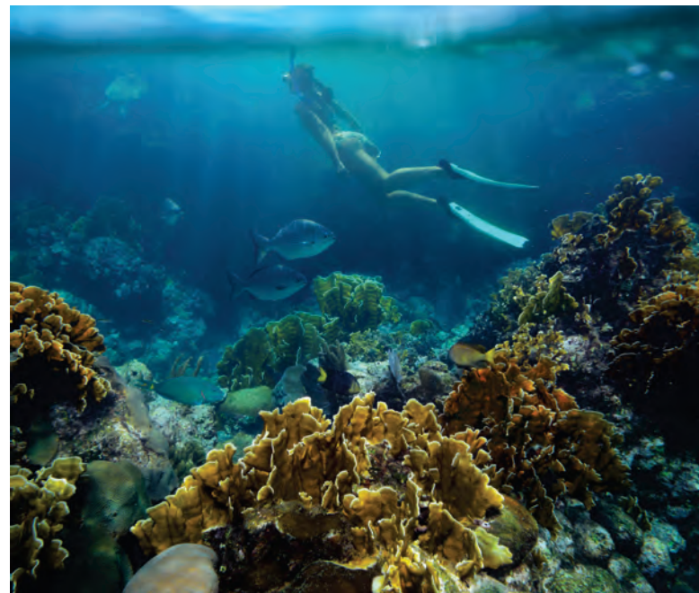
The Leisuretime II sand filter does to your pool what the coral does to the ocean. "It Keeps it clean."