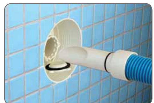
Insert Cleaner Connector, ready to vacuum.