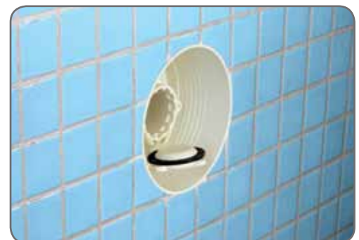
Remove Dress Ring Cover, open spring loaded port.